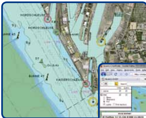
ENC overlay

⇒ Contains example developer code for a web-client „ChartPortal“