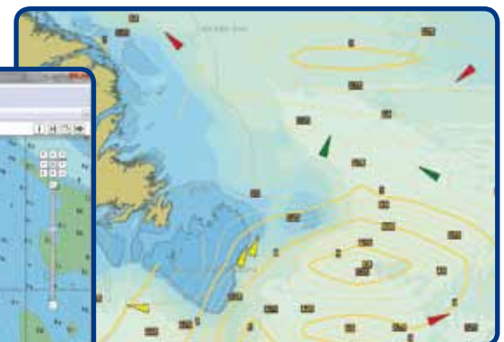
Fleet tracking (Wave heights by OpenMetoc.net.no)